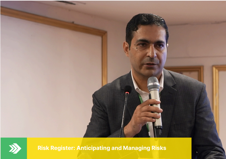
Risk Register: Anticipating and Managing Risks