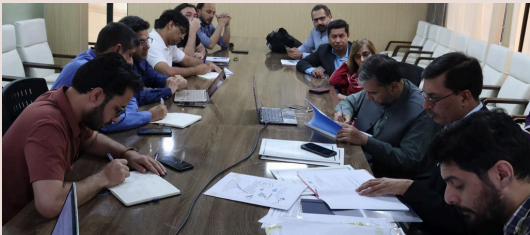
Component II MHSP Updates