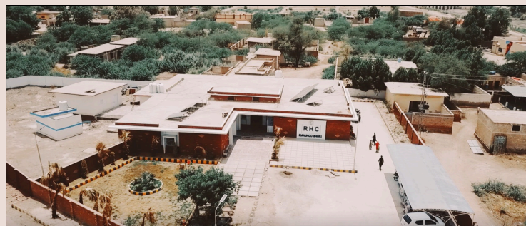
REHABILITATION OF RHC, MANJO SHORI BY MOPD&SI IFRAP