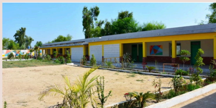
REHABILITATION OF GOVERNMENT BOYS TAJ MOHAMMAD LEHRHI SCHOOL, NASEERABAD BY MOPD&SI IFRAP