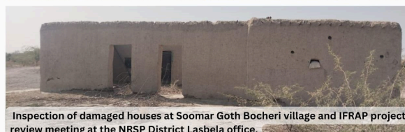
Inspection of damaged houses at Soomar Goth Bocheri village and IFRAP project review meeting at the NRSP District Lasbela office.