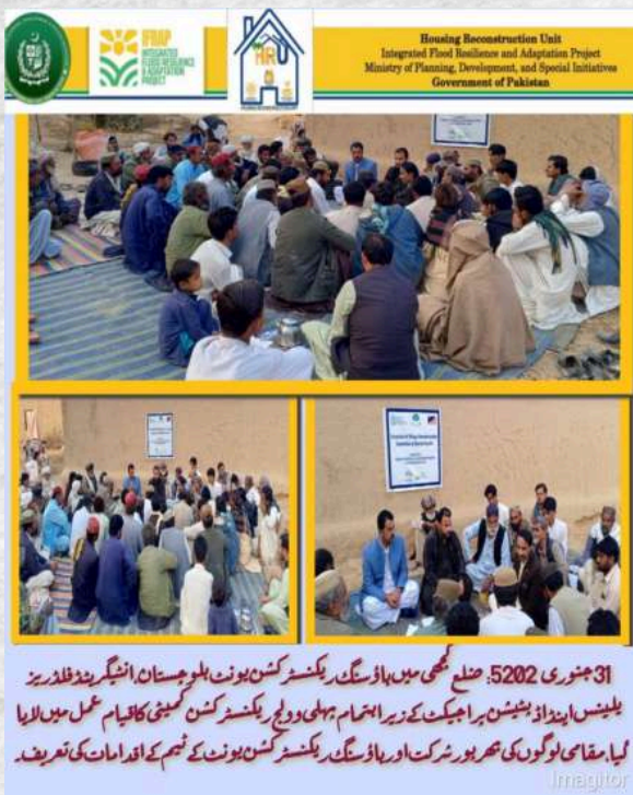
VRC establishment at District Kachhi

Ministry of Planning Development & Special Initiatives IFRAP- Housing Reconstruction Unit Balochistan turning challenges into opportunities and building a stronger, more resilient future—For the People, By the People.