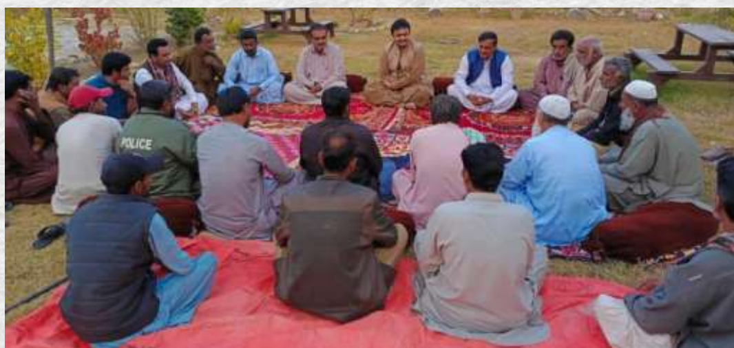
Tribal heads having an inclusive dialogue at District Lasbela