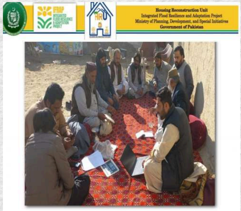
VRC establishment at District Duki