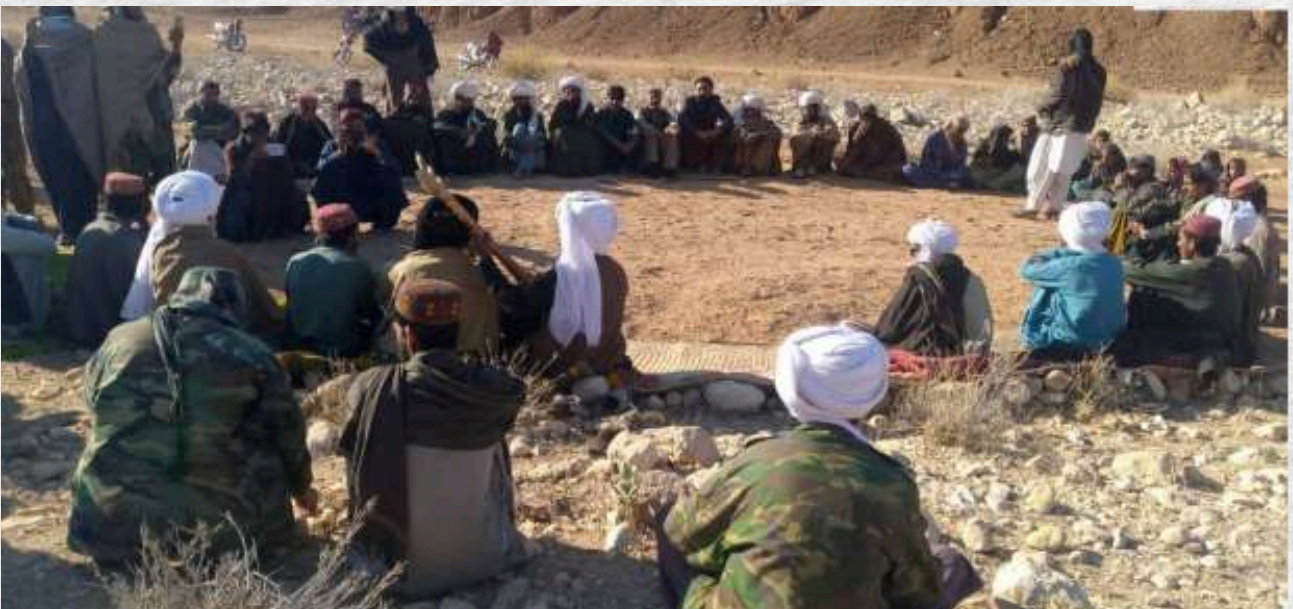
Community Engagement and Awareness Sessions in District Kohlu

Community ownership is the foundation of sustainable recovery. In the flood-affected regions of Balochistan, IFRAP's Post-Flood 2022 Housing Reconstruction Unit is pioneering a participatory approach that puts people at the center of rebuilding efforts. Through the formation of Village Reconstruction Committees (VRCs), local residents are no longer passive beneficiaries but active decision-makers in reconstructing their own homes and communities.