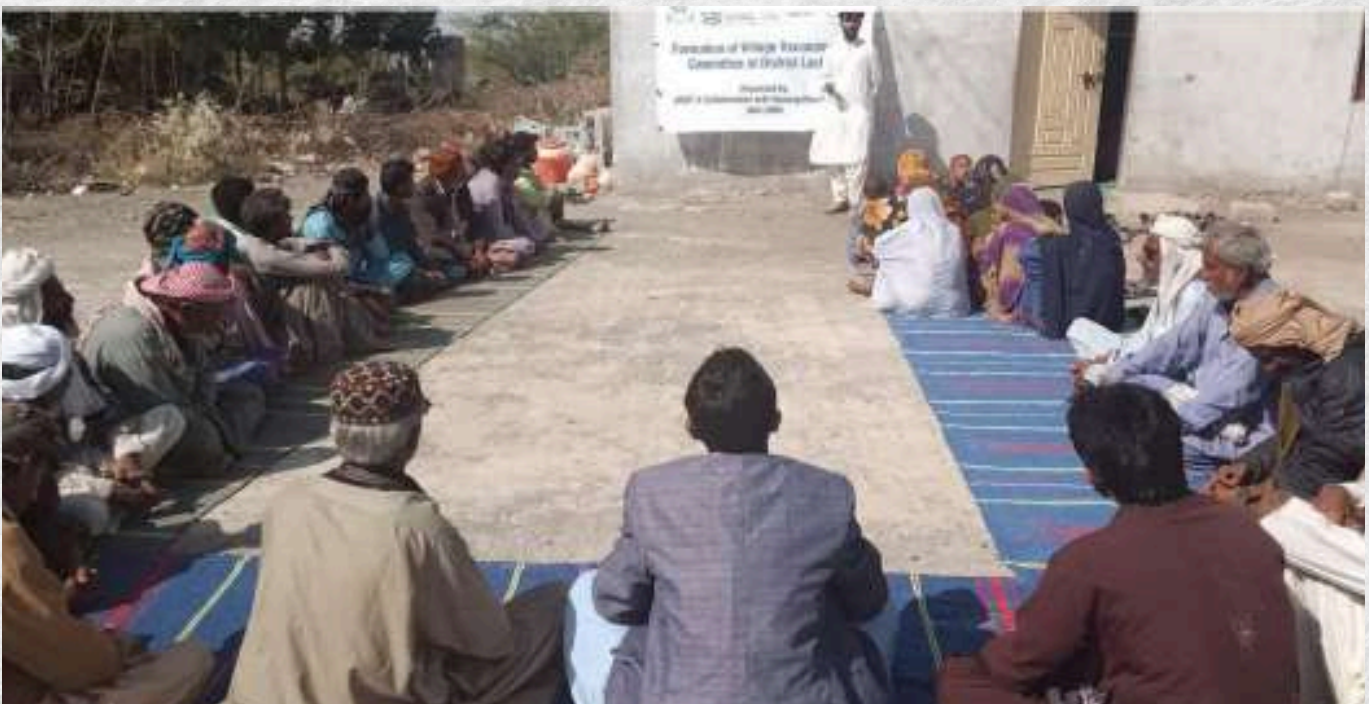
Formation of Village Reconstruction Committees VRCs in District Lasbela